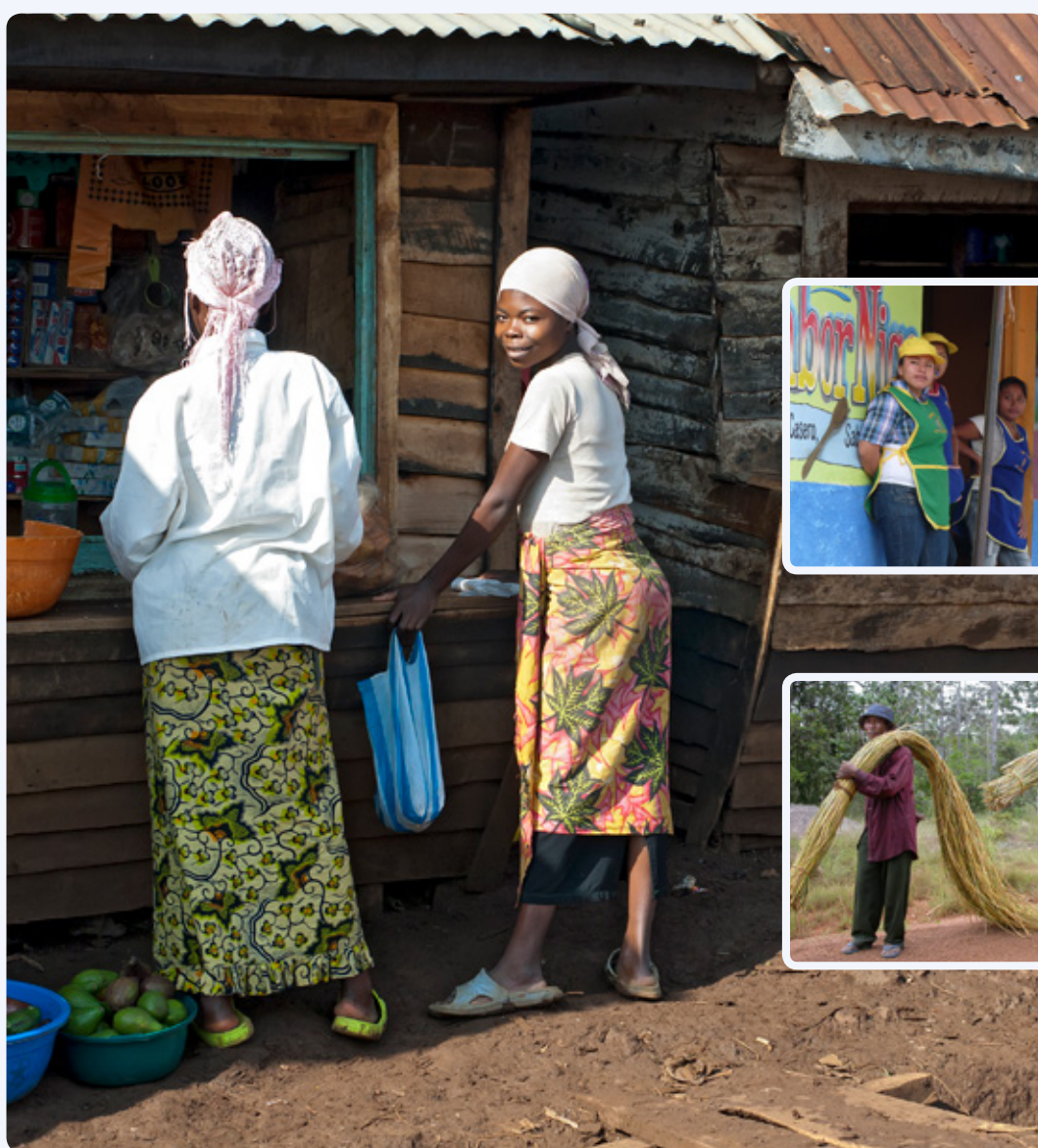
TEREA oversees the preparation and implementation of Local Development Plans for forest municipalities in the Central African Republic.

(from 5 to 10 years). The LDP integrates all aspects of the municipality's socio-economic development, taking into account the available competences and the needs of local populations. It includes elements from the participatory diagnosis from all segments of the population.