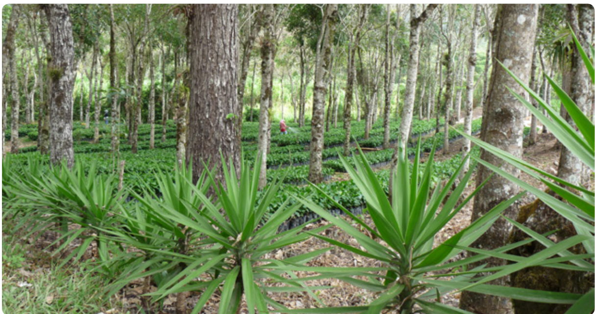
Agroforestry plantation in Nicaragua

particularly for soil protection, since the tree has an agro-economic function within the production system.