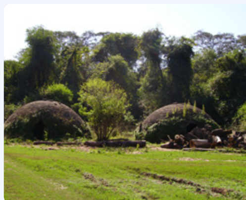
Coal furnaces in the Yungas in Argentina

The exploitation of wood for energy purposes, in particular the production of charcoal, is a very important source of deforestation and forest degradation. However, charcoal is essential for local populations, and its production cannot be reduced in the absence of sustainable alternatives. TEREA supports the federation of Nigerian coal producers to help them certify the legal origin of their production.